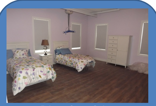
Private Guest Suites Rooms have track lifts, low pressure beds, private roll-in showers, separate caregiver room