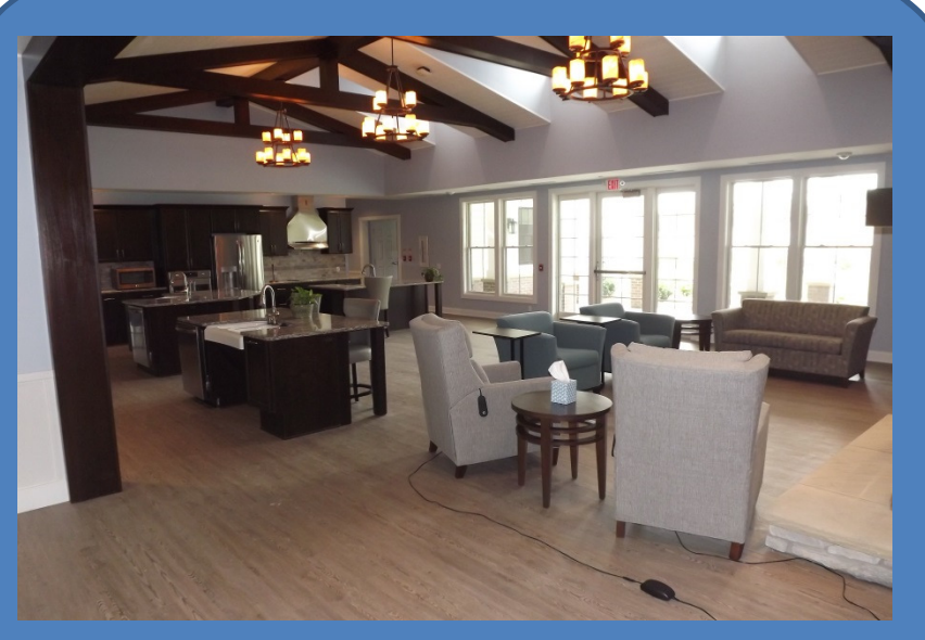
Common Great Room & Kitchen and Patio

All stays arranged by appointment only – no walk-ups